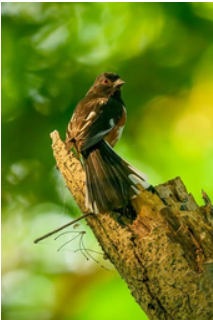
1st Place Craig Hedlund Eastern Towhee