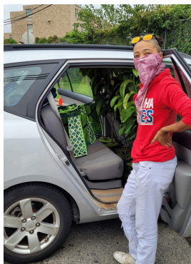
A local resident poses with their new tree