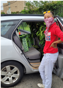
A local resident poses with their new tree