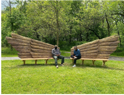
Phragmites benches crafted by Sarah Kavage