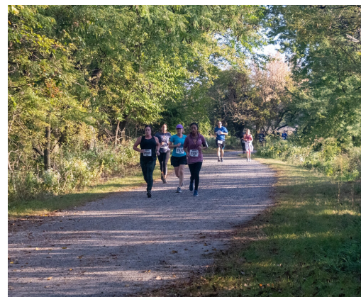
Participants running along a beautiful refuge trail during the Monarch Dash 5K

This year, FOHR held their 2nd Annual Monarch Dash 5K right before the Annual Philly Fall Nature Festival. The race took place in the morning with a total of 85 participants, an increase from last year's participation! NovaCare provided snacks and answered orthopedic questions about aches and pains. The race was professionally timed by Bryn Mawr Racing Company and an award ceremony was held afterwards with prizes for top place winners. Following the race, participants were encouraged to join in Philly Fall Nature Fest activities. A huge thank you to L.L. Bean for being a sponsor!