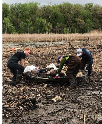
Volunteers pulling a large plastic pool and children's vehicle from Tinicum marsh

The Darby Creek Cleanup is one of the largest events organized by the Heinz Refuge. This major cleanup event is celebrated in recognition of Earth Day and is sponsored by our partner, Darby Creek Valley Association. The cleanup is always scheduled at low tide to allow volunteers to have access to the refuge's mudflats. The refuge is a recipient of storm borne trash traveling downstream and tidal borne trash sweeping in from the Delaware River. In both cases, much of the trash settles onto our mudflats and remains there until someone comes along to pick it up. As a result, cleaning up the refuge is an ongoing challenge. Despite the rain this year, we had 90 enthusiastic volunteers from Student Conservation Association, PennEnvironment, Trash Academy, Tree Philly, and of course, Friends of Heinz Refuge! We were able to clear more than 8,000 lbs of trash, but the reality is that there is so much more to do. While cleanups are very much needed, the solution to trash will take more action. FOHR supports this annual event by providing volunteers, providing lunch, and promoting the event.